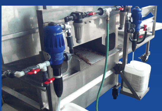
Sanitization Option Includes:

Sanitization chemical pumps Mount for 5 gallon chemical storage containers Sanitization manifold in machine