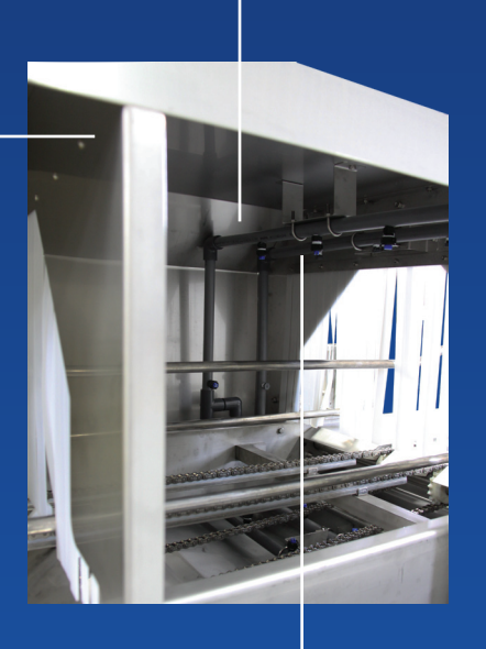
Sanitizing Section (Optional) Includes spray nozzles on all sides