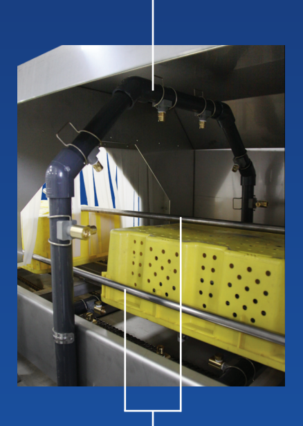
Adjustable Guide Rails Easily adjusted by hand for cleaning different sized lugs